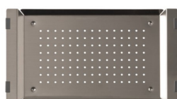
Flat Drainer Rack Inox (**)