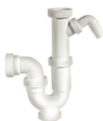
Simple kitchen syphon