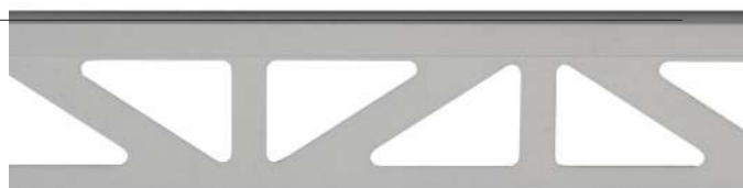
pro-mate 5 - 100004927