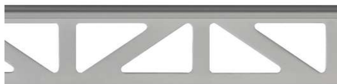
pro-mate 3 anodized aluminium silver