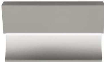
pro-skirting led anodized