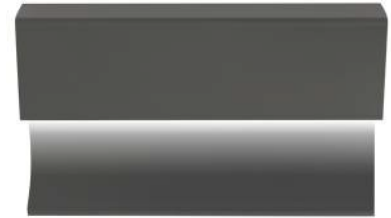
pro-skirting led black