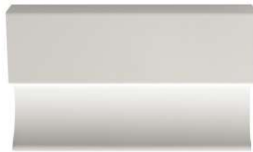
pro-skirting led white